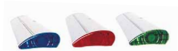
Grey trim set is standard. Red, Blue, and Green are extra accessories.